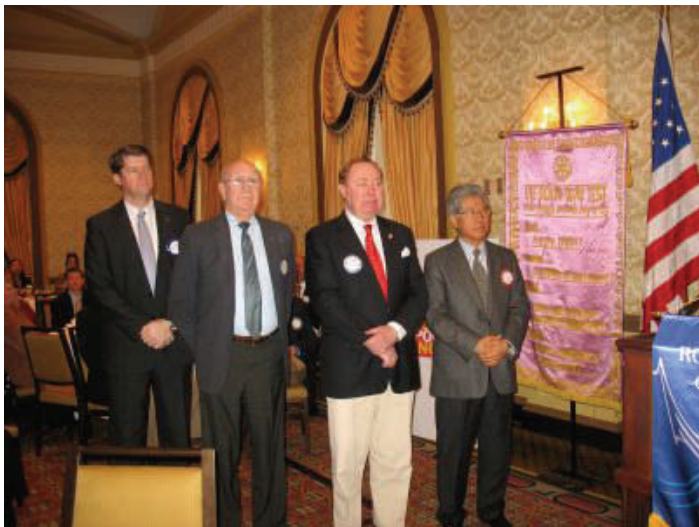
Paul Harris Fellow Ceremony