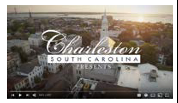
Watch a video about the Charleston/Embassy Suites/ Convention Center

This is a Rotary experience not to be missed that you will long remember as we seek the goal of "Rotary: Making a Difference."