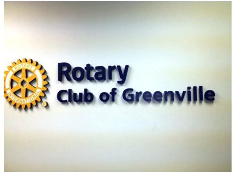
Our new wall logo in the Rotary Office