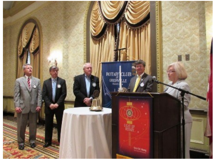
The Installation of Officers for the 2014-2015 year