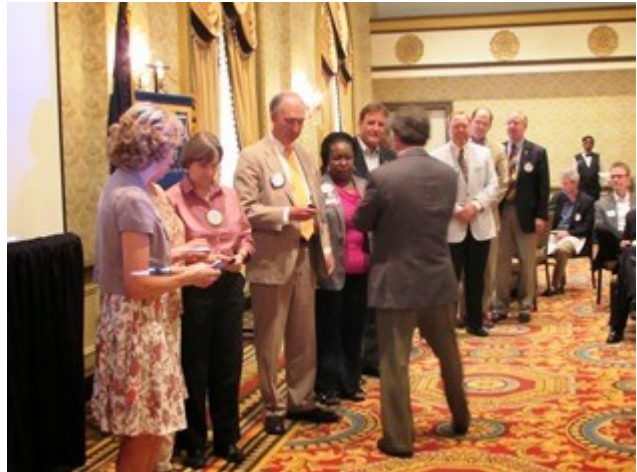
Recognition of 2013-2014 Member Sponsors

Four members sponsors two or three members in the last year including: