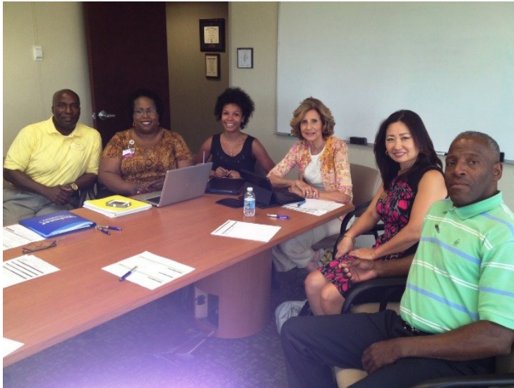
Diversity Committee members planning the next recruitment event targeted for January 2015.