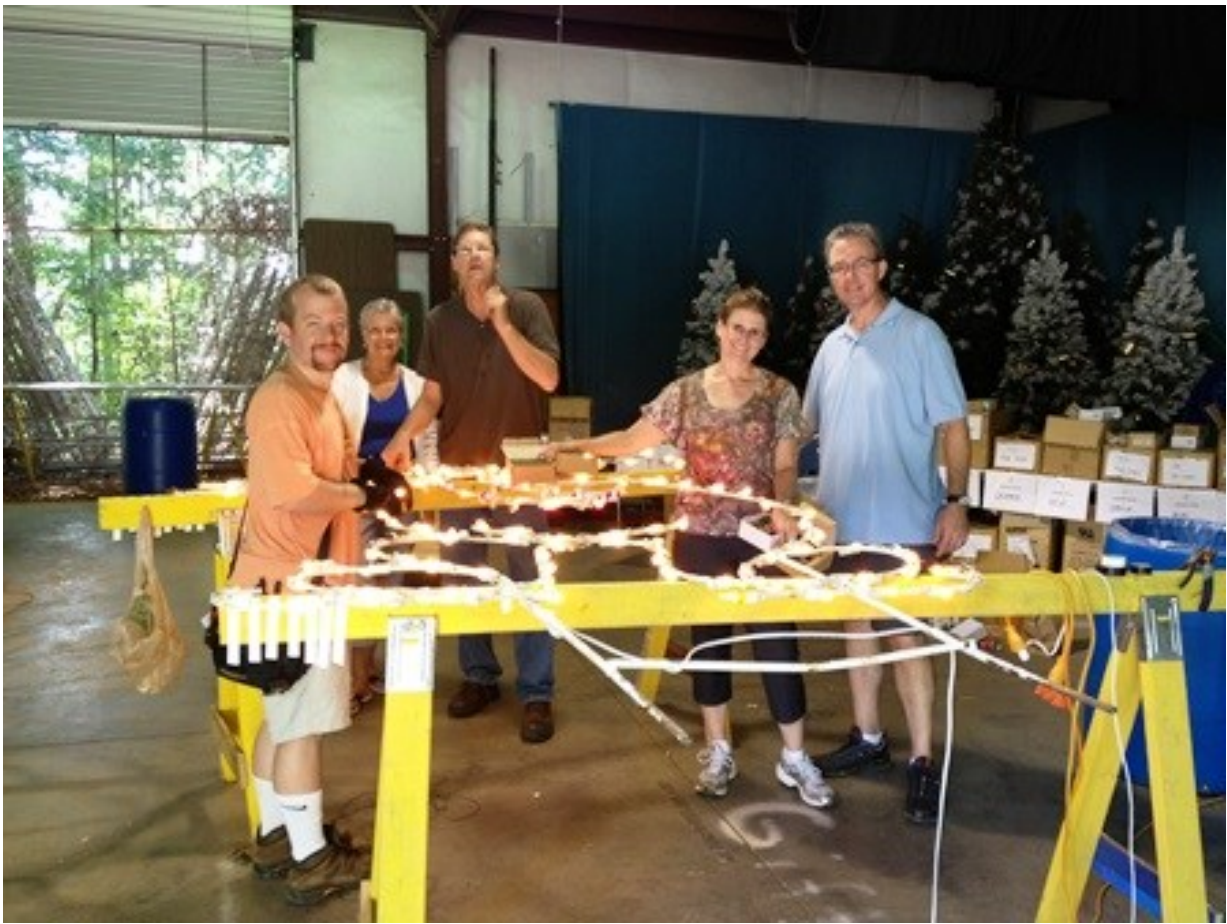
A dedicated team of volunteers came out for our first weekend of Holiday Lights set-up.