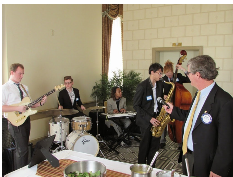
The Fine Arts Center Jazz Quintet