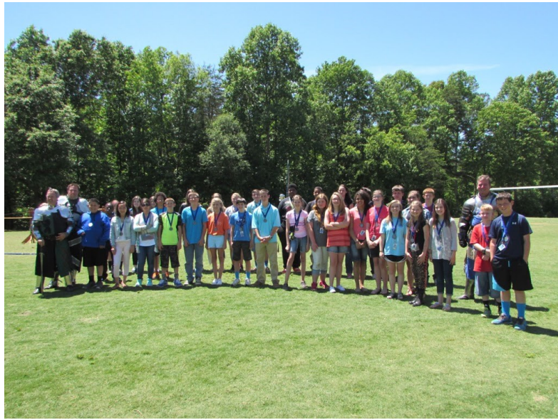
Students at Northwest Middle School honored by Early Act First Knight