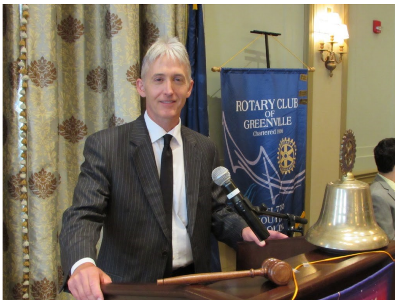
Speaker, US Congressman Trey Gowdy