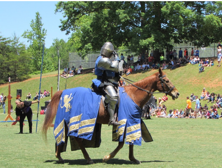
Early Act First Knight