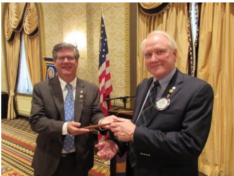
The passing of the Presidential Gavel