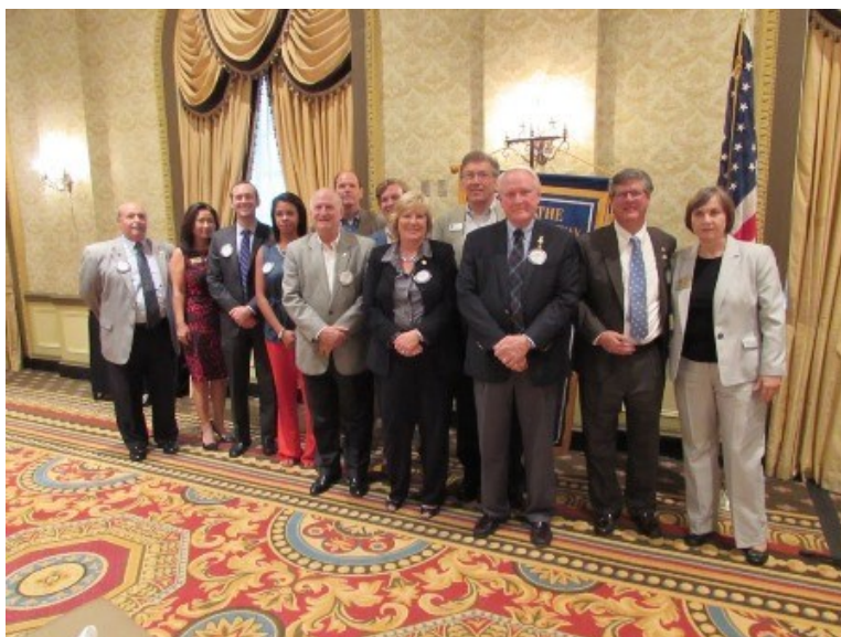
2015-2016 Rotary Club of Greenville Board of Directors