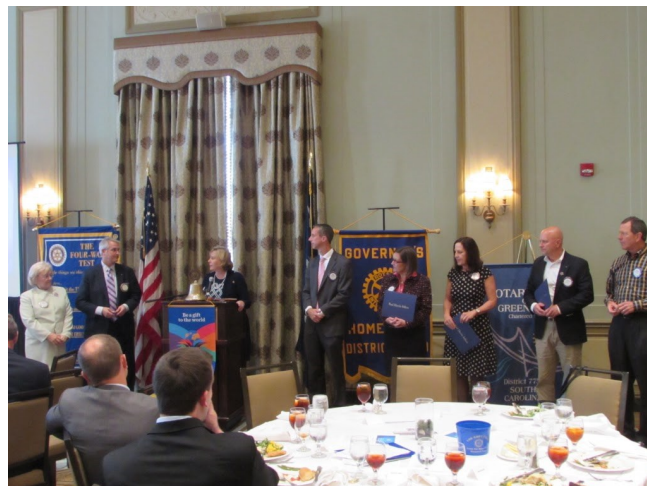
Congratulations to Paul Harris Fellows