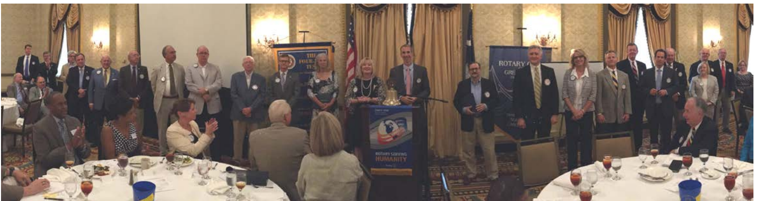
New Paul Harris Fellows and PHF+'s receive recognition at the last club meeting.