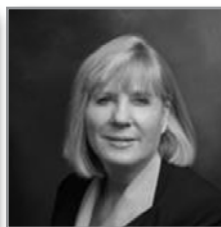
Delisa English Foundation and Giving