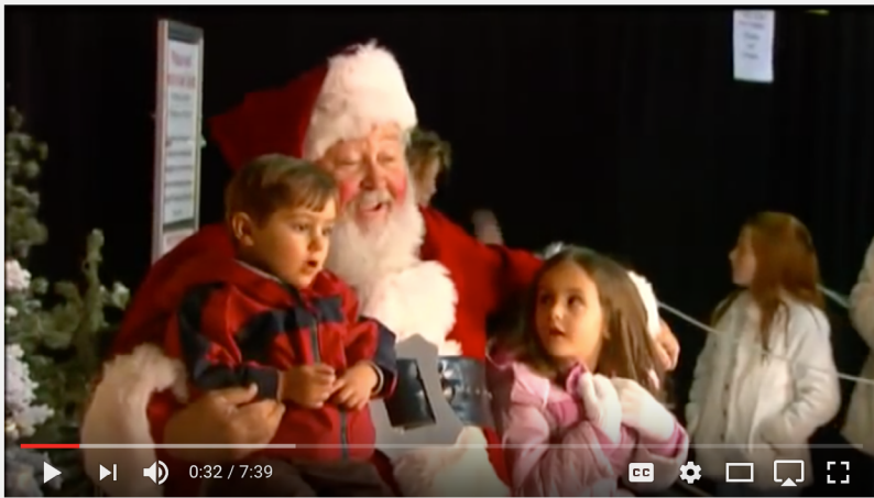
Roper Mountain Holiday Lights