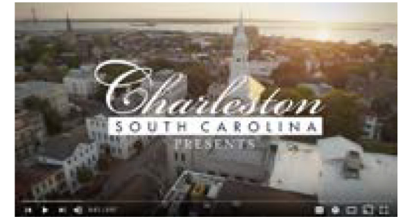
Watch a video about the Charleston/Embassy Suites/ Convention Center

This is a Rotary experience not to be missed that you will long remember as we seek the goal of "Rotary: Making a Difference."