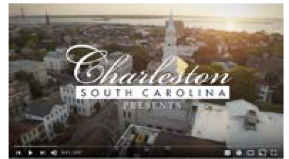
Watch a video about the Charleston/Embassy Suites/ Convention Center

This is a Rotary experience not to be missed that you will long remember as we seek the goal of "Rotary: Making a Difference."